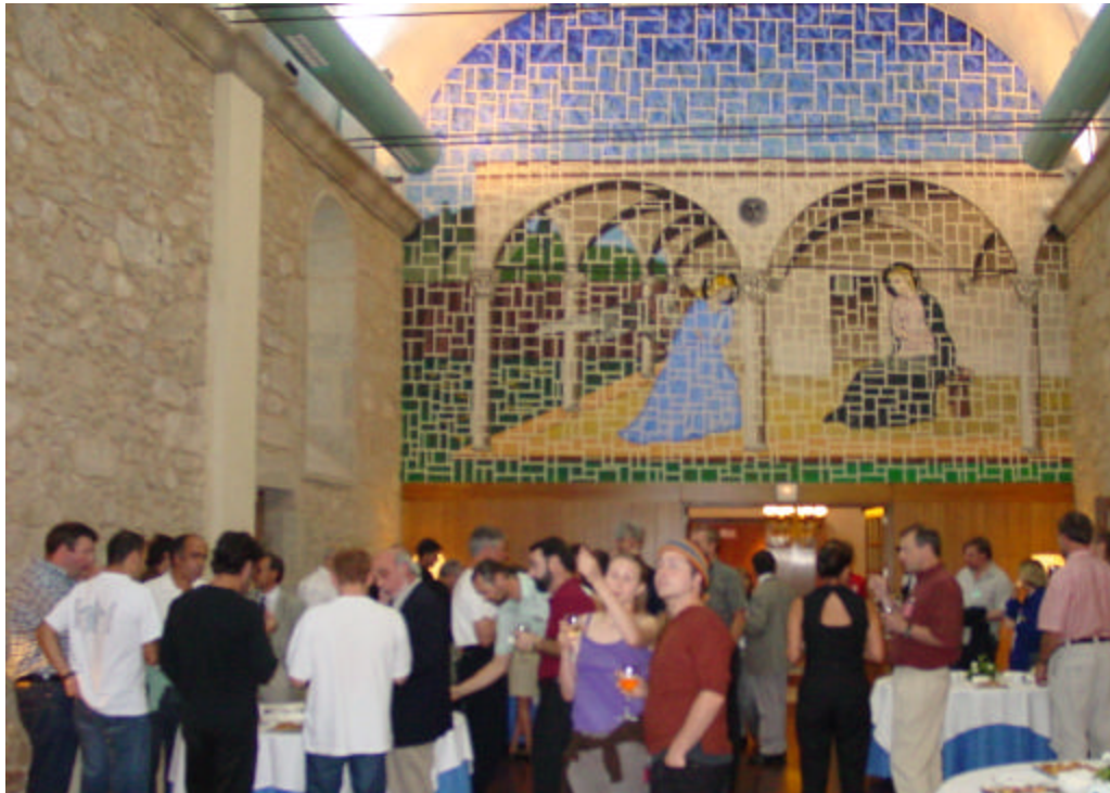
Participants at Reception Room: Hotel AC Palacio Del Carmen