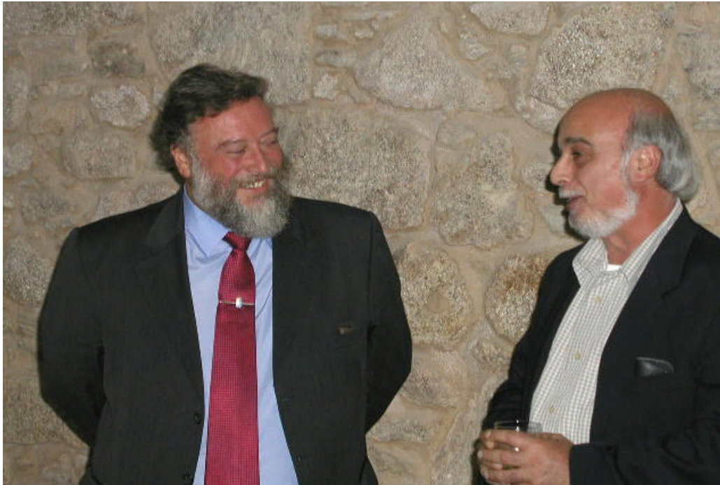
Reception: E. Lopez-Veiga, Minister of Fisheries of the Galician Government and R. K. Mayo, Chair Scientific Council, at the Reception held for participants of the Symposium at Hotel AC Palacio Del Carmen, 11 September 2002.