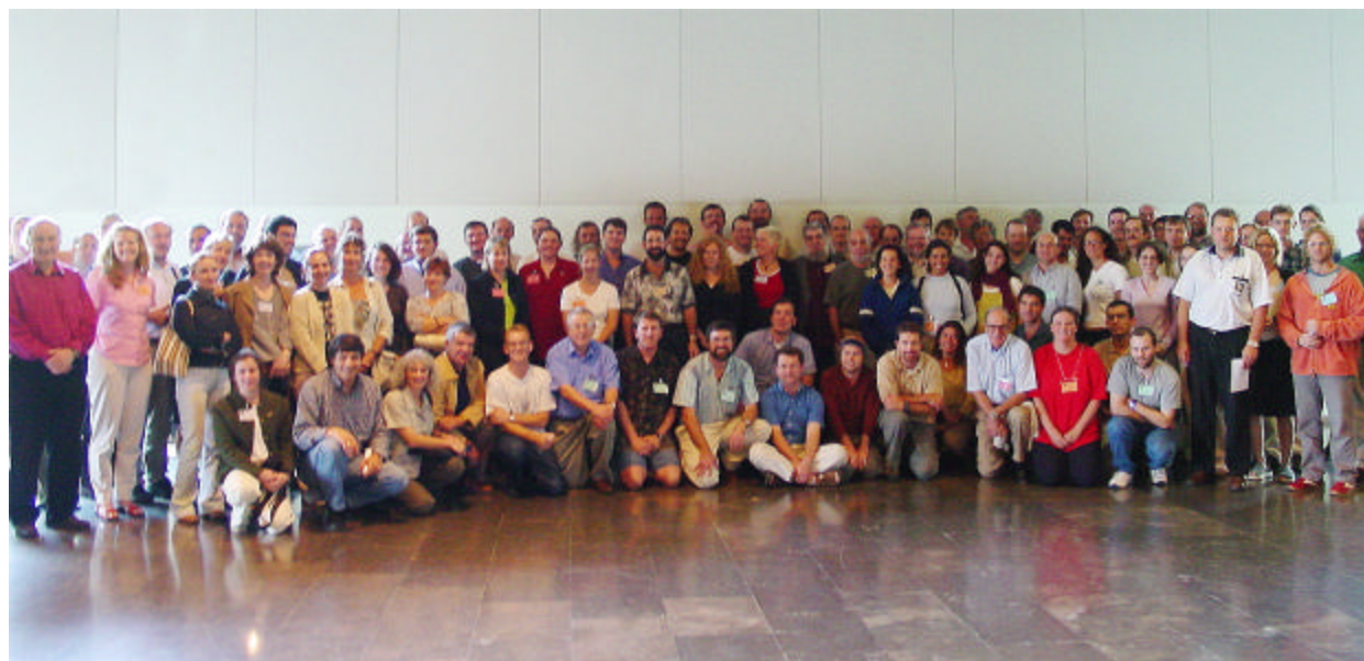
Participants of the Symposium on Elasmobranch Fisheries: Managing for Sustainable Use and Biodiversity Conservation 11-13 September 2002