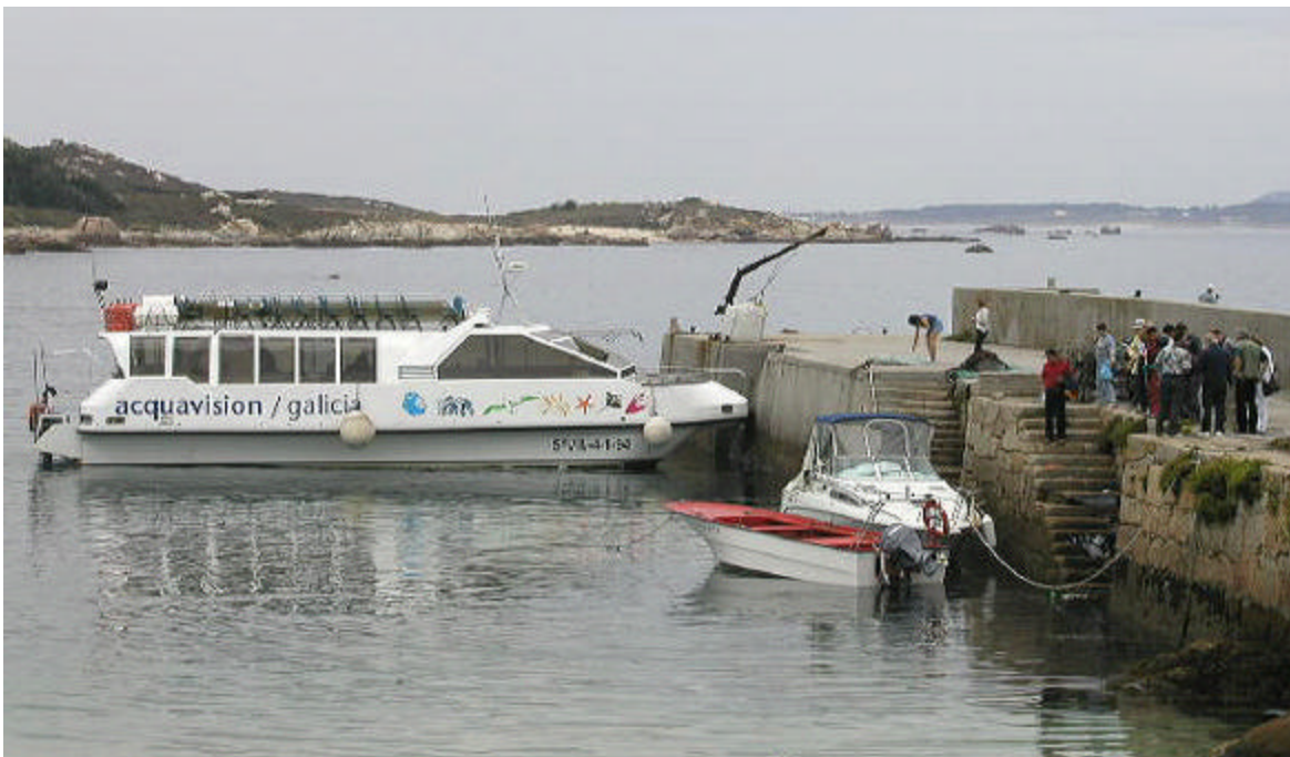
Scientific Council Outing sponsored by Galician Hosts, 15 September 2002