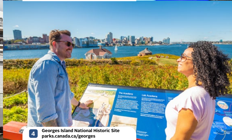
4 Georges Island National Historic Site parks.canada.ca/georges