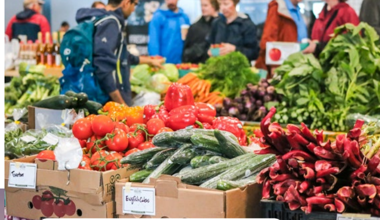
3 Halifax Seaport District portofhalifax.ca/halifax-seaport/