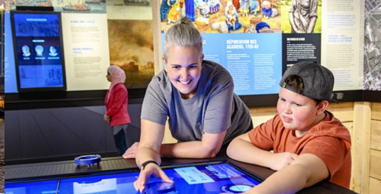
5 Halifax Citadel National Historic Site parks.canada.ca/halifaxcitadel