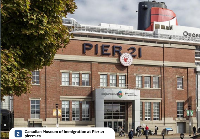
2 Canadian Museum of Immigration at Pier 21 pier21.ca