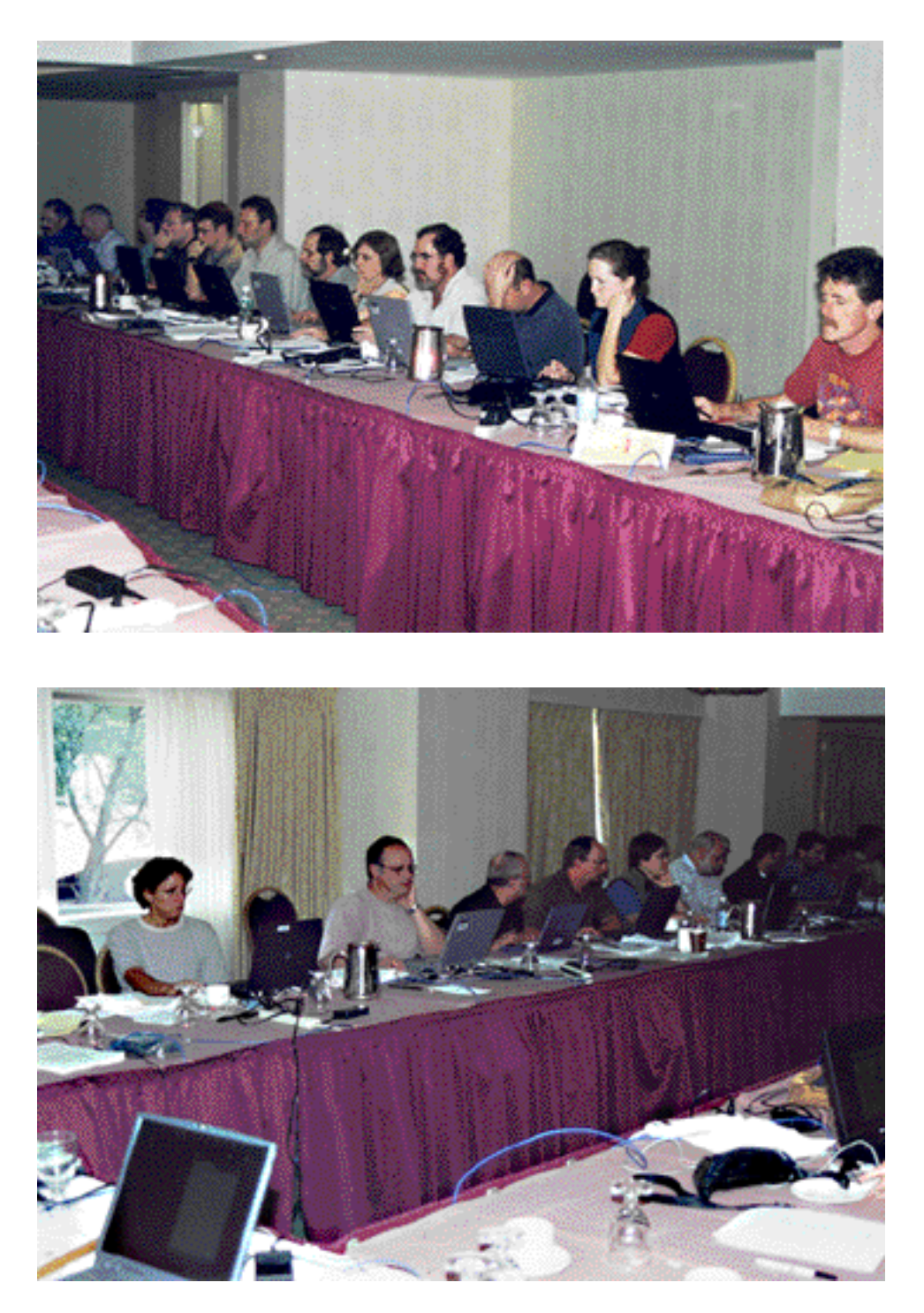
Participants in session during Workshop on Assessment Methods.