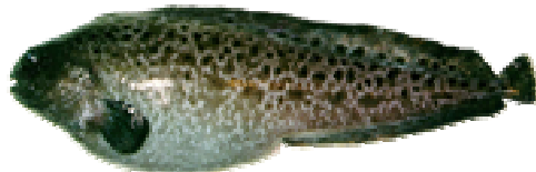
Northern (broadhead) Wolffish Threatened (Note: Most northern wolffish are a solid colour).

Thus, it is requested that countries fishing in the NRA report catches of wolffish by species. The 3 three species that can be encountered in Div. 3LMNO are shown below (note that northern wolffish are a solid dark colour).