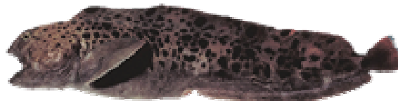
Spotted Wolffish Threatened